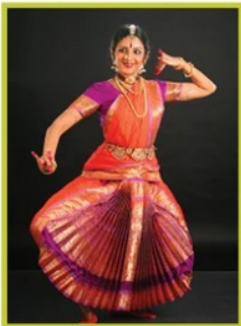
Bharata Natyam (From Tamil Nadu)