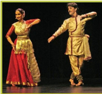
Kathak (From Uttar Pradesh and Rajasthan)