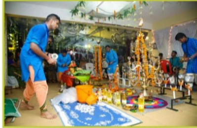
Ramabhajanam from Andhra Pradesh