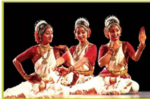
Kuchipudi (From Andhra Pradesh)