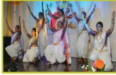
Jhakri from Maharashtra