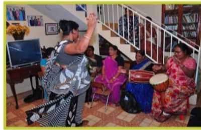
Bhojpuri dance from Bihar (Geetgawai)