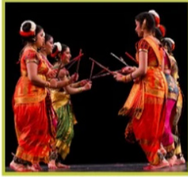
Kollattam from Tamil Nadu